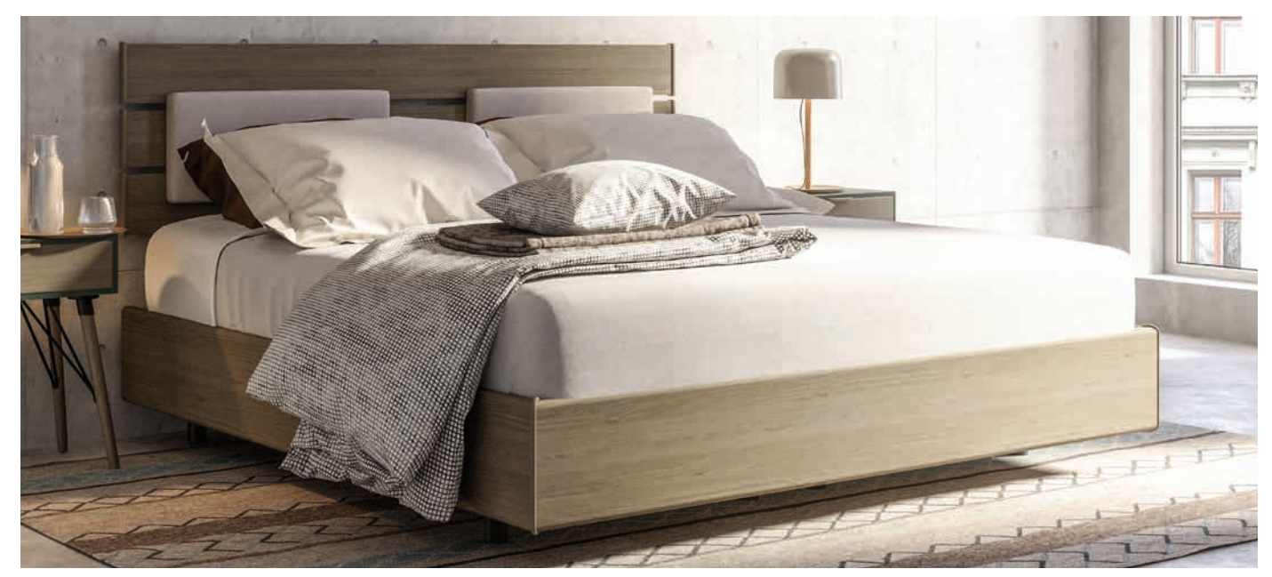
Swissflex® CLICK, height 26cm, headboard Wood 3 with Pillows Deco 105cm, Wood look Gladstone Oak Grey